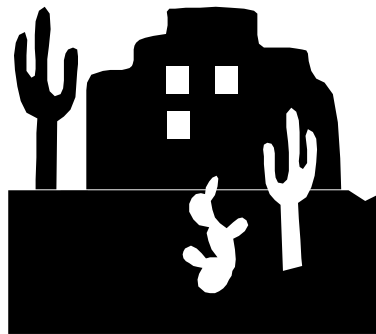
The Southwest at Christmas

they are running out of names (or at least imagination). I saw one recently named Chaparral Creek, which would be okay if there were chaparral (small evergreen oak) trees present. Since there are scrub oak present we could allow poetic license but there isn't a creek within miles of the place!! Anyway, the whole point is if you haven't been in the area recently, you'll be surprised at the changes. A good thing about all the growth is it reflects high employment and a strong economy in the area. I believe that the only people unemployed are those who don't want to work. Last year as I wrote, we were attempting to sell our house. Well, there were too many new houses on the market at the time and we had lived here 9