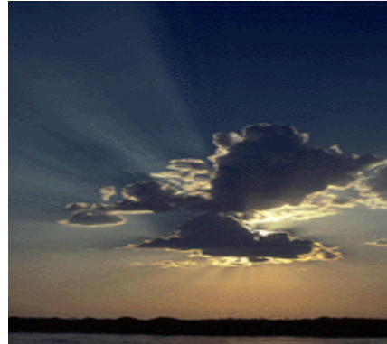
Isaiah 9:6-7 New Century Version