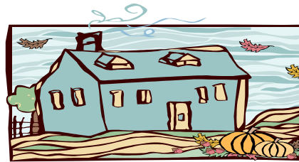
Not our house, ours is brick!!