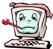
Sick computers are D&D's friends