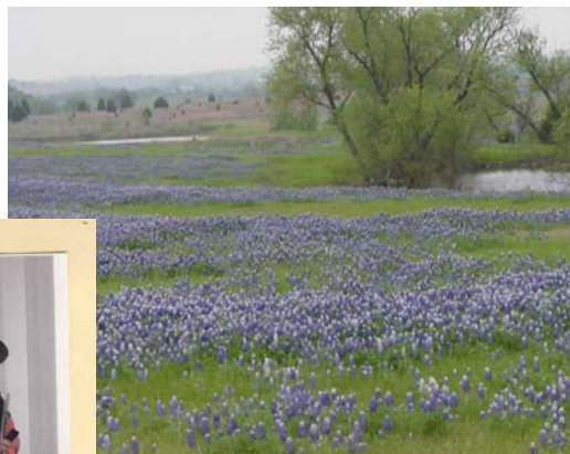
Texas Bluebonnets make the spring spectacular