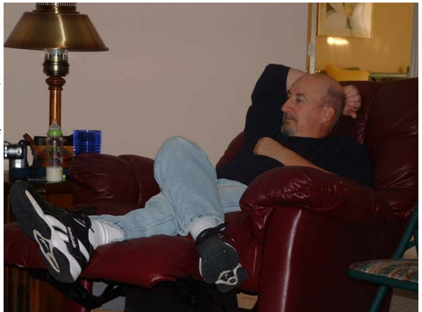
Editor in Chief planning the 2004 edition while watching the Eagles beat the Cowboys.