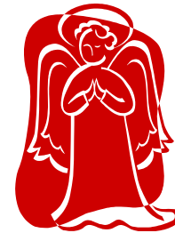
Joy to the World

News to all you see and Merry Christmas and a Prosperous New Year to all.