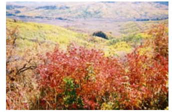
Somewhere in Southern Wyoming.

There is talk that our division will begin to take on international data centers, so this may change.