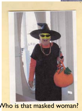
Who is that masked woman?