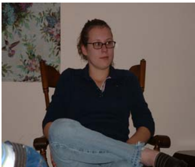
What have I gotten myself into?

The editor in chief insisted that I put in some photos to finish off this page so here we go.