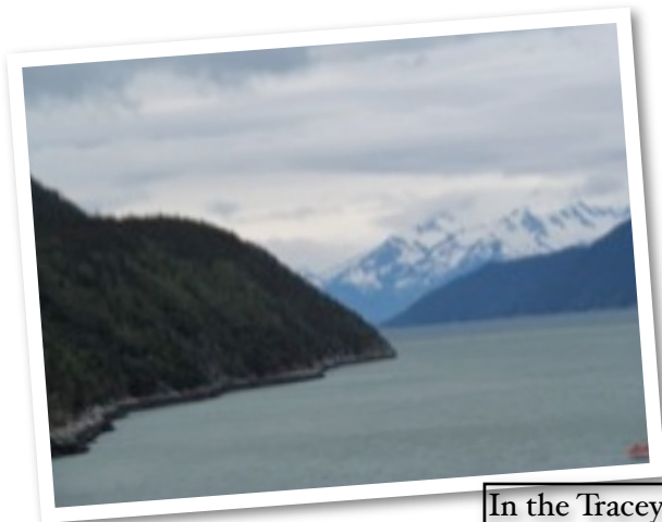
In the Tracey Arm, July 3rd, 2012

The last port of call before returning to Seattle was in Victoria, BC, Canada one of the prettiest cities, I think, that we have ever seen. It was easy to see why many Canadians retire there.